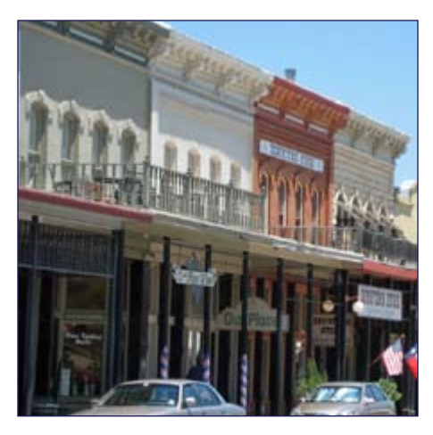
Granbury, Texas

have seen first-hand the real human impact of these harmful loans.